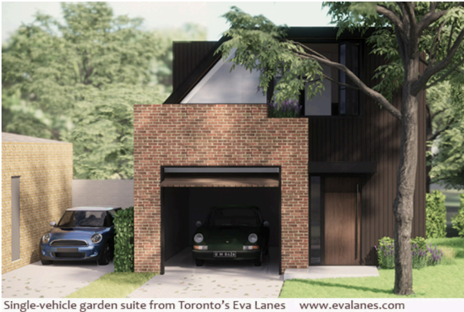
Single-vehicle garden suite from Toronto's Eva Lanes www.evalanes.com

The new garden suite regulations received political approval at Toronto City Hall on February 2, 2022, and on July 4, 2022 emerged successfully from an appeal process that had delayed the implementation slightly.