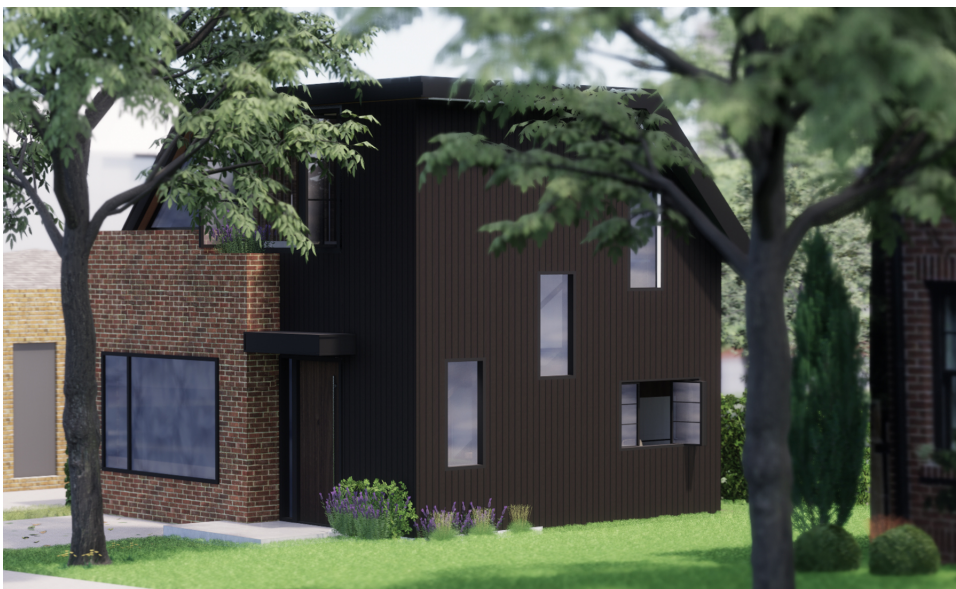
2-storey garden suite from Toronto's Eva Lanes - www.evalanes.com

The new building is a mostly-autonomous auxiliary dwelling unit, normally up to 6.0m (19.68 feet) tall, that cannot be legally severed from the main property, but is permitted a wide variety of uses, including as a revenue-producing (rental) unit. Where practical, some will have optional indoor vehicle parking.