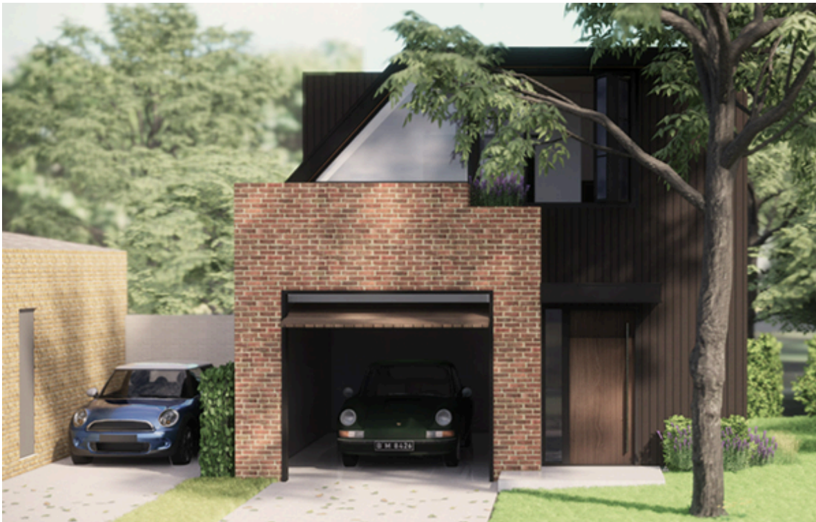
Single-vehicle garden suite from Toronto's Eva Lanes www.evalanes.com

The new garden suite regulations received political approval at Toronto City Hall on February 2, 2022, and on July 4, 2022 emerged successfully from an appeal process that had delayed the implementation slightly.